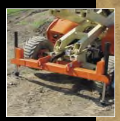
Optional One-Touch Leveling Jacks for Faster Set Up

Wide Platforms Get You Closer to Your Work Area