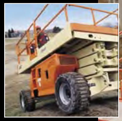
Twin Pump Power Delivers Unmatched Terrainability