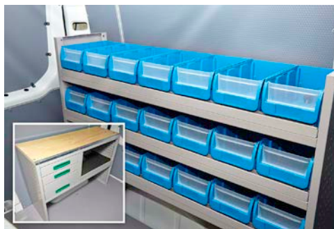
Workshop interior (optional)