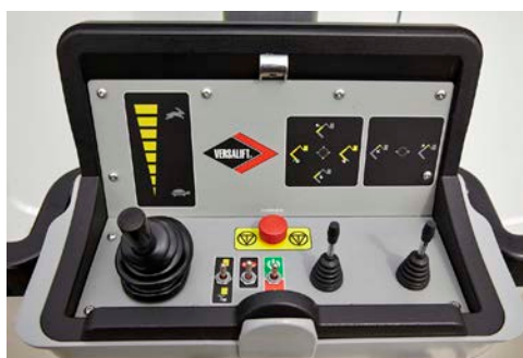
RLC (Relay Lefthand proportional Controls): Fixed outreach and 1 action at a time