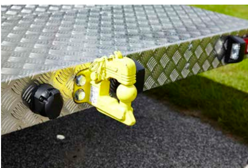
Tow bar (optional)