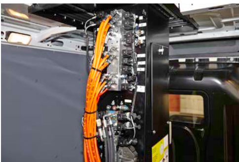
Ground level emergency lowering from the load area (pedestal mounted valve bank)